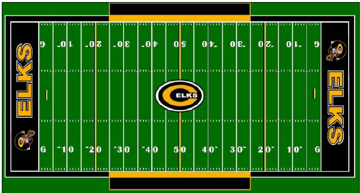
An artist's rendering shows what Centerville High School's Stadium will look like once the Field of Tradition turf is installed.

The new turf will be available for the first home football game and marching band performances scheduled for Friday, September 1st, 2006.