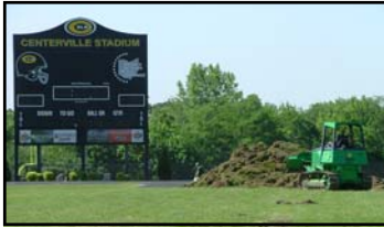
Construction begins!! See pages 2-3